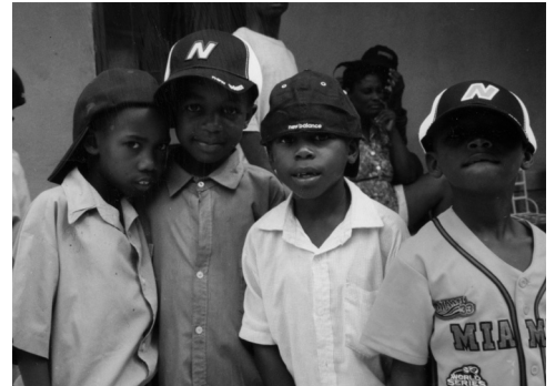
FLM students enjoying their new hats.

As we began each camp the children were shy and reserved but it didn't take long for their smiles to break forth. The joy of the whole program was to hear the children laugh and sing and watch them having a good time. With rapt attention they listened to Bible stories and health classes, and they delighted in the experience of making craft projects. From one class room you could hear the children learning to sing "Our God Is an Awesome God" in English, and in the courtyard you could hear their shouts and cheers during their favorite game, dodge ball. The canteen was in operation, and each day the children received a hearty meal of rice and vegetable sauce.